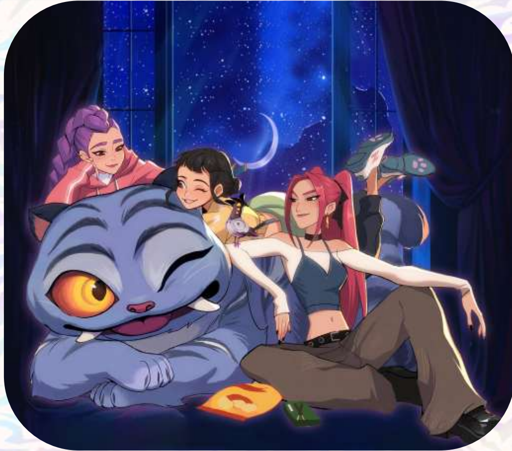
HUNTR/X: Rumi | Zoey | Mira Comic Relief/Messengers: Derpy | Sussie